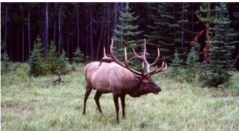
Figure 2 - Bugling bull elk in project area

The project area is a mix of private, county, state and federal (NFS, BLM and Department of Army) managed lands, and presents a unique opportunity to work across boundaries to increase overall project efficiency and effectiveness.