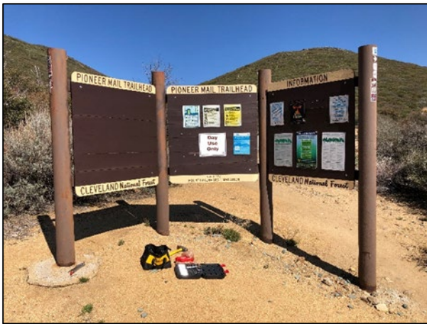
Pioneer Mail Trailhead signboard before updated interpretive signage was added