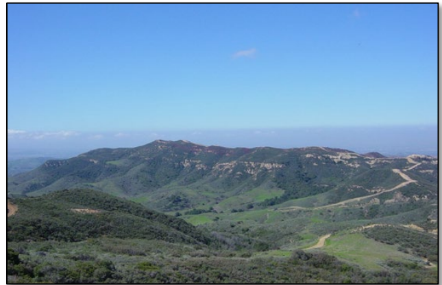
Trabuco District on the Cleveland National Forest