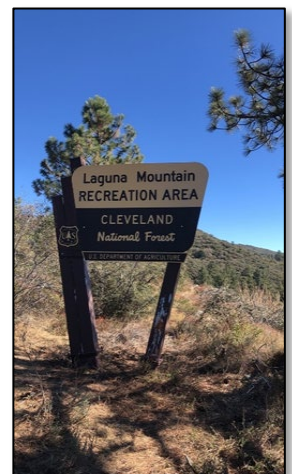
Before and after of installation of new Laguna Mountain Recreation Area sign bought with recreation fee funds