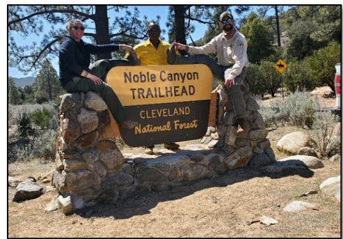
Noble Canyon trailhead sign replacement

The Noble Canyon Trail is a popular trail with mountain bikers, trail runners, and hikers alike. It is a huge draw to urban San Diego residents and tourists visiting the area because of its rugged ledge hugging switchbacks, steep slopes, and jagged rocks. Recreation fees were used to improve the trail and update outdated signage at the trailhead.