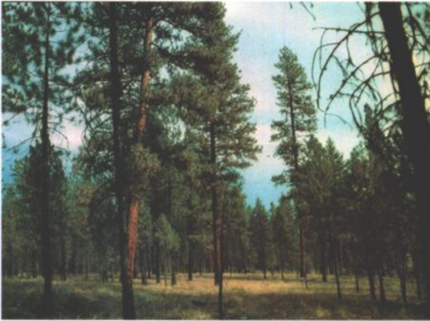
Five distinct cohorts are represented in a multiaged ponderosa pine stand in western Montana, including one that predates European settlement and several that resulted from selection system harvests.

the reverse-J curve has led to problems: