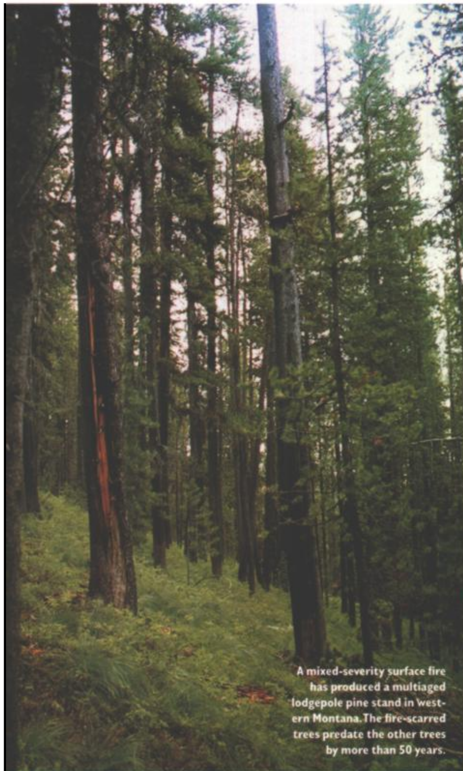
A mixed-severity surface fire has produced a multiaged lodgepole pine stand in western Montana. The fire-scarred trees predate the other trees by more than 50 years.