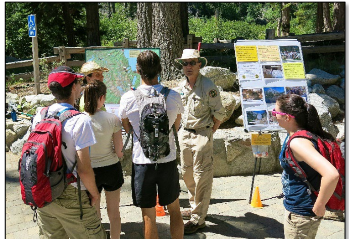
Eagle Falls Trailhead to Desolation Wilderness

Volunteers donated thousands of hours cutting downed trees out that had fallen over popular trails after windstorms blasted through the Sierras; educating our visitors about the importance of caring for a Wilderness; maintaining trails and suppressing small wildfires that did occur; and most importantly, striving to preserve the natural environment inside Desolation Wilderness in 2021.