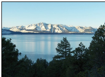
View of Mt. Tallac, a scenic part of the Desolation Wilderness overlooking Lake Tahoe