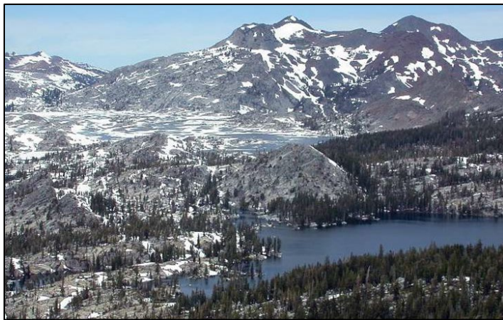
View of the Heart of the Desolation Wilderness

USDA is an equal opportunity provider, employer, and lender.