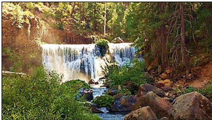
Middle Falls on the McCloud River