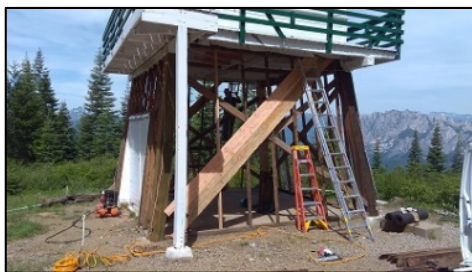
Replacing lookout support beams

The Girard Ridge Lookout, located at 4,809 feet above the Sacramento River Canyon, was constructed in 1931 was restored in 1997. In 2017, the forest invested $6,000 of recreation fee funds into the lookout by replacing the staircase to meet safety standards, installing a vapor barrier to protect internal supports from decay, installing a new sheathing to meet historical standards which increased sheer strength and protection of internal framing and support posts, and replacing two 10x10 inch rotten and decaying structural/main support beams.