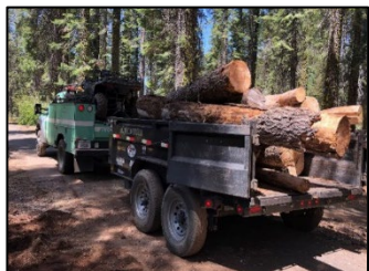
A truck carrying logs from blowdown at Little Grass Valley Reservoir