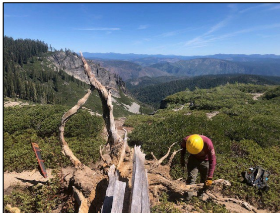
Forest employee maintaining the Pacific Crest Trail Bucks Lake Wilderness