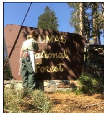
Forest employee paints a sign on the Beckwourth Ranger District

outfitter and guide permits, and recreation events went towards maintaining trails, recreation sites, and areas where these activities take place, or in nearby areas where recreation opportunities are located.