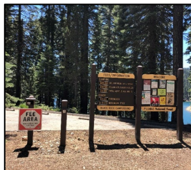
New sign at Black Rock Campground

Little Grass Valley Reservoir has six fee sites operated with fee revenue. During winter of 2021, there was a strong wind event which created blowdown and damage to infrastructure at these campgrounds.