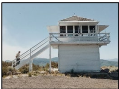
Black Mountain Lookout