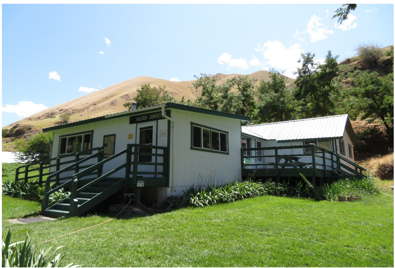
(Cache Creek Visitor Center and Ranch house)

There are two residences in Hells Canyon: Cache Creek Administrative Site, located in Oregon about 30 miles south of the Lewiston Idaho and Clarkston Washington valley. This river portal check in station is about a half of mile beyond the Washington/Oregon border. Kirkwood Historic Ranch located on the Idaho side of the river, is about 6 miles south of the Snake River Pittsburg Landing boat launch. For reference, he closest town is White bird Idaho off of US HWY 95.