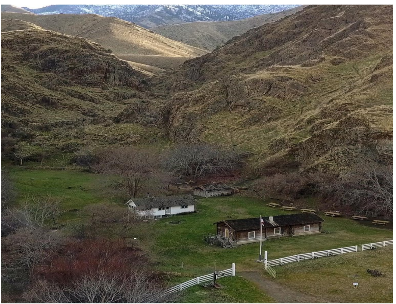
(trail coming into Kirkwood house and museum)

20 minute trip by jetboat. For those who may have friends hiking in from the landing, its a six mile hike along the Snake River trail #102 to Kirkwood.