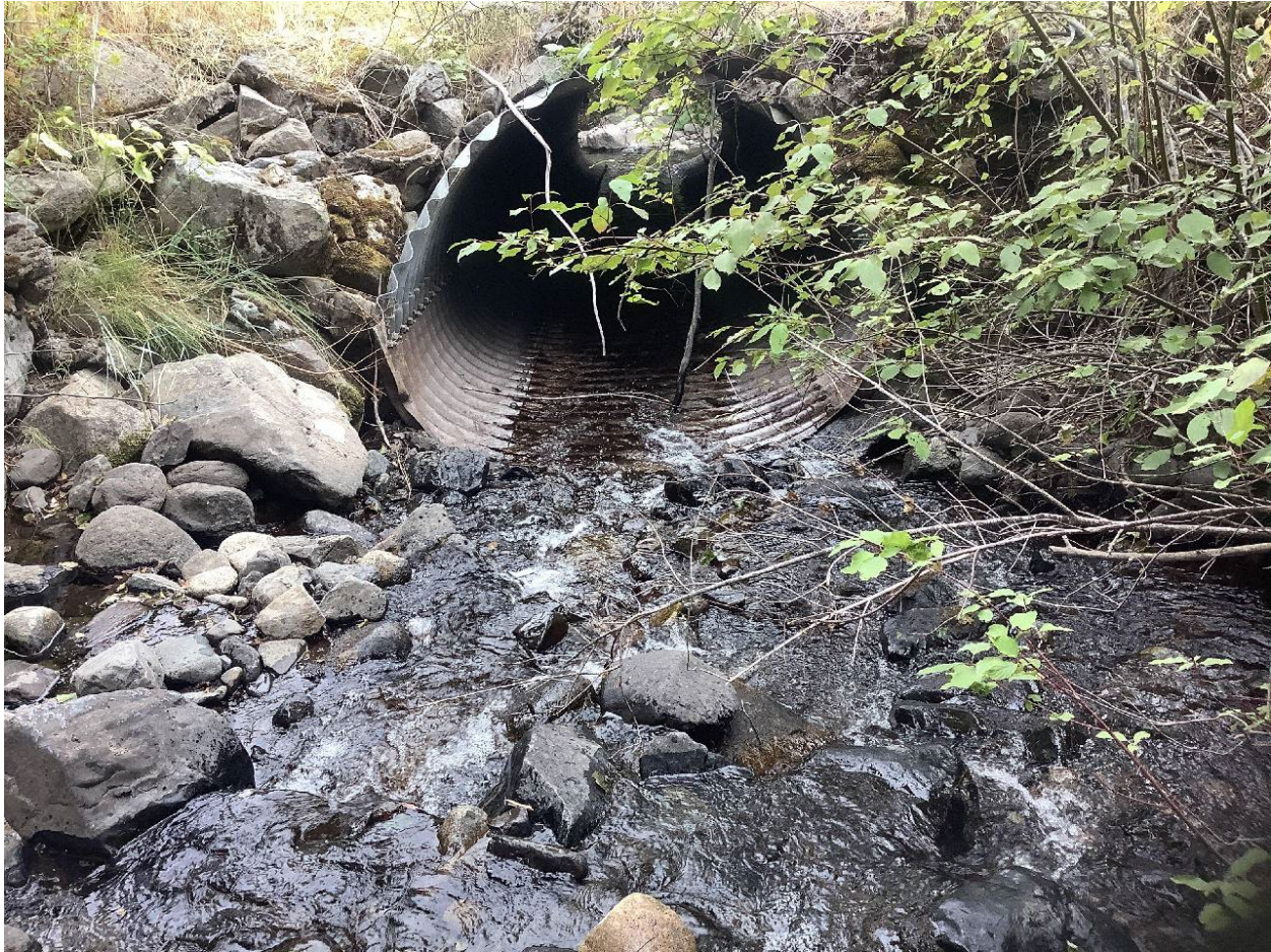
Figure 4. Current misaligned inlet of culvert on Big Boulder Creek.