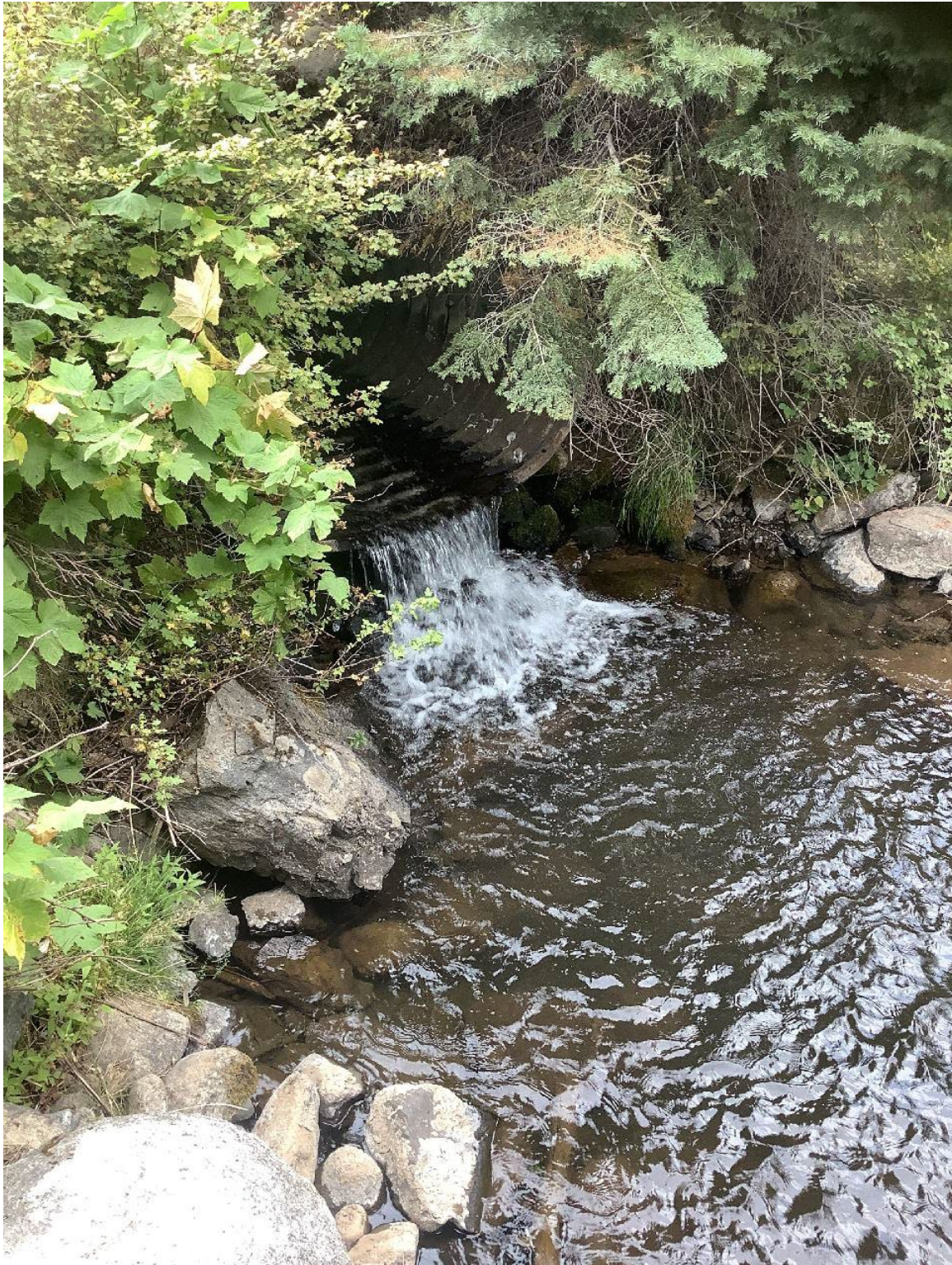
Figure 3. Perched outlet of current Big Boulder Creek culvert.