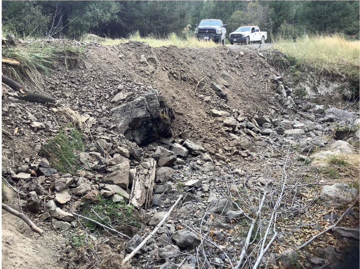
Figure 5. National Forest System road 4550000 embankment damage from Big Boulder Creek above culvert.