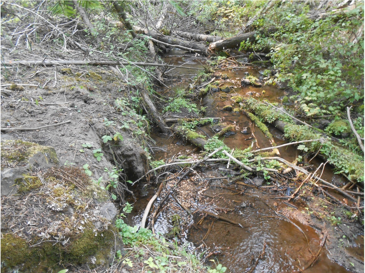
Figure 1. Example of ungulate trailing to West Fork Deer Creek