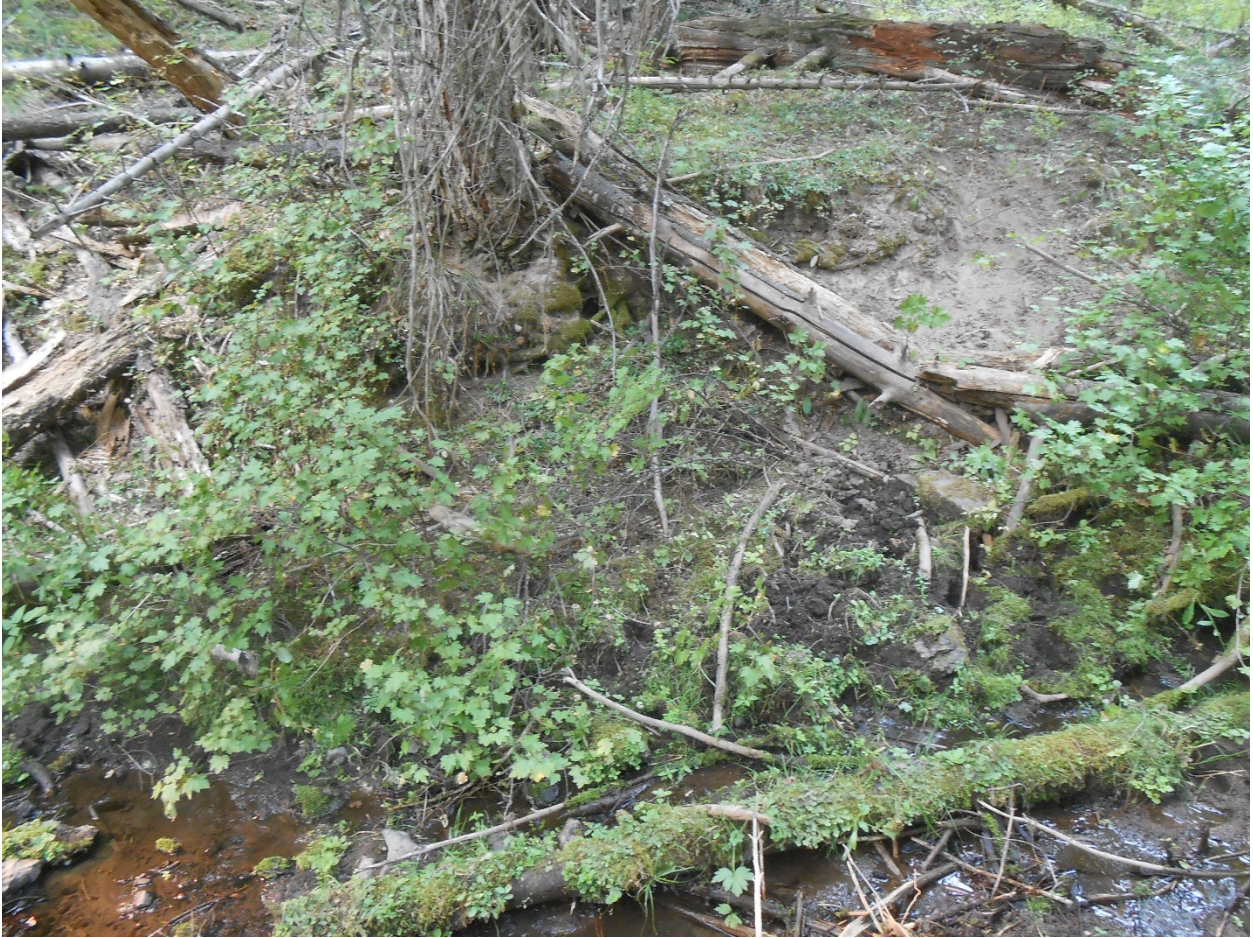
Figure 2. Another example of ungulate trailing