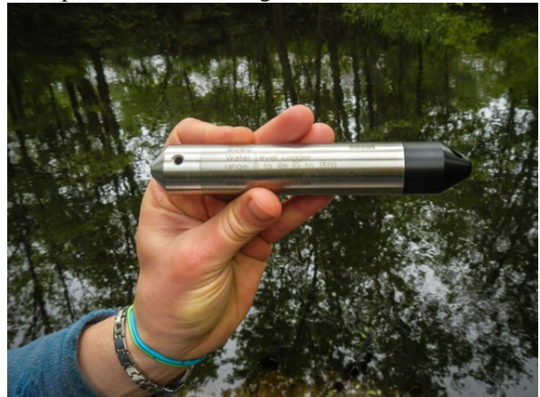
Figure 3. Example of pressure transducer that records hourly measurements