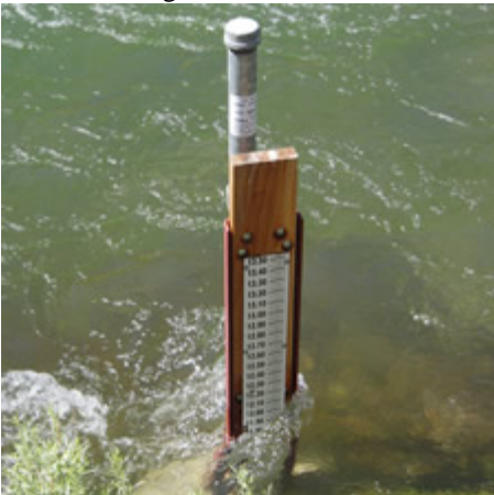
Figure 2. Staff gauge and pipe with pressure transducer housed inside