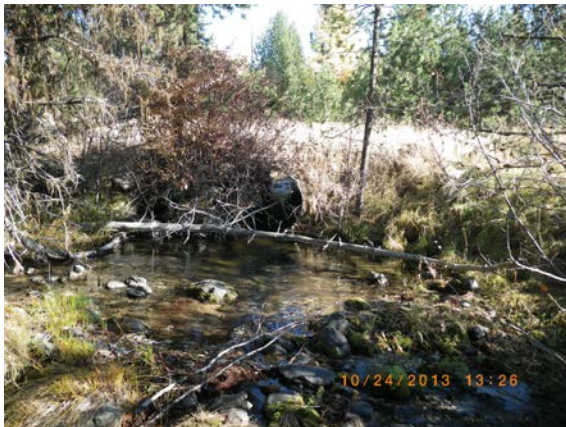
Figure 2. Deadwood Creek existing culvert outlet showing large scour pool formed by excessive stream energy concentrated by undersized culvert.