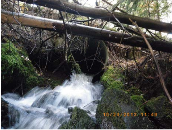
Figure 4. East Fork Big Creek existing culvert outlet showing perched outfall, no jump pool for fish passage, and streambed scouring from stream flow concentrated by undersized culvert.