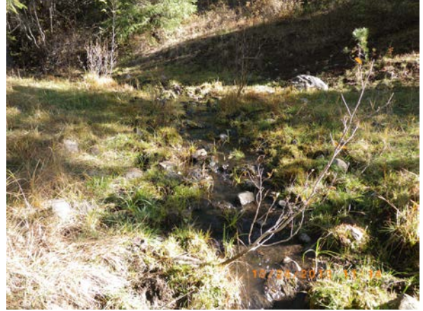
Figure 5. Sediment delta formed above East Fork Big Creek existing culvert inlet indicative of an undersized culvert with reduced capacity to transport sediment through the crossing.