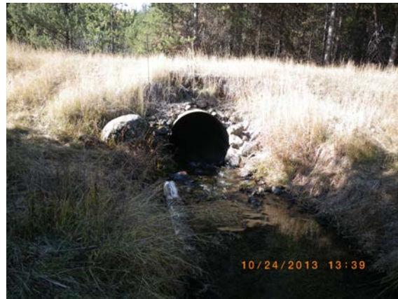
Figure 3. Deadwood Creek existing culvert inlet showing active erosion around inlet from undersized culvert.