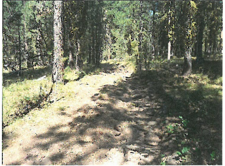
Treatment for a headcut includes adding erosion control features like large woody debris, seeding, planting, geotextile fabric, and adding substrate.