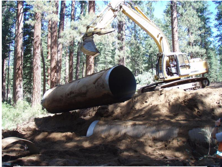
An excavator or backhoe will be used to remove problematic culverts and reconstruct and stabilize the channel before replanting.