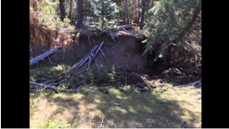
2016 photo of Crooked Creek showing deep incision, headcut, conifer encroachment, and unstable banks.