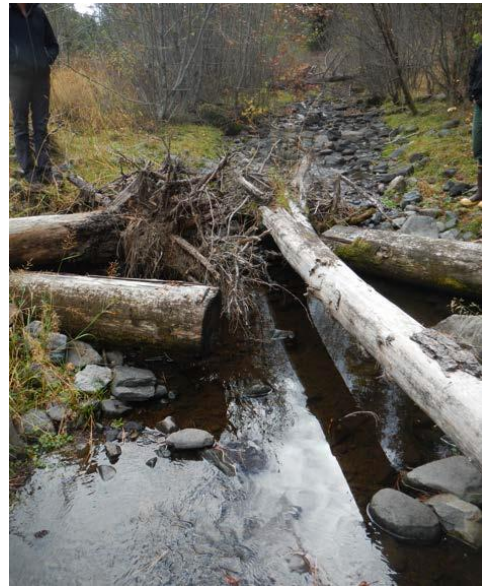
Representative stream restoration using root wads and large wood completed in Camp Creek 2015