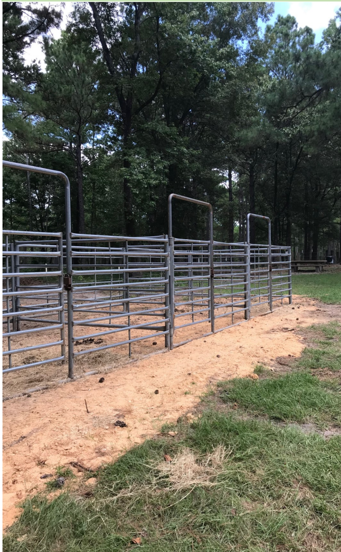
Gum Springs Horse Trail Map