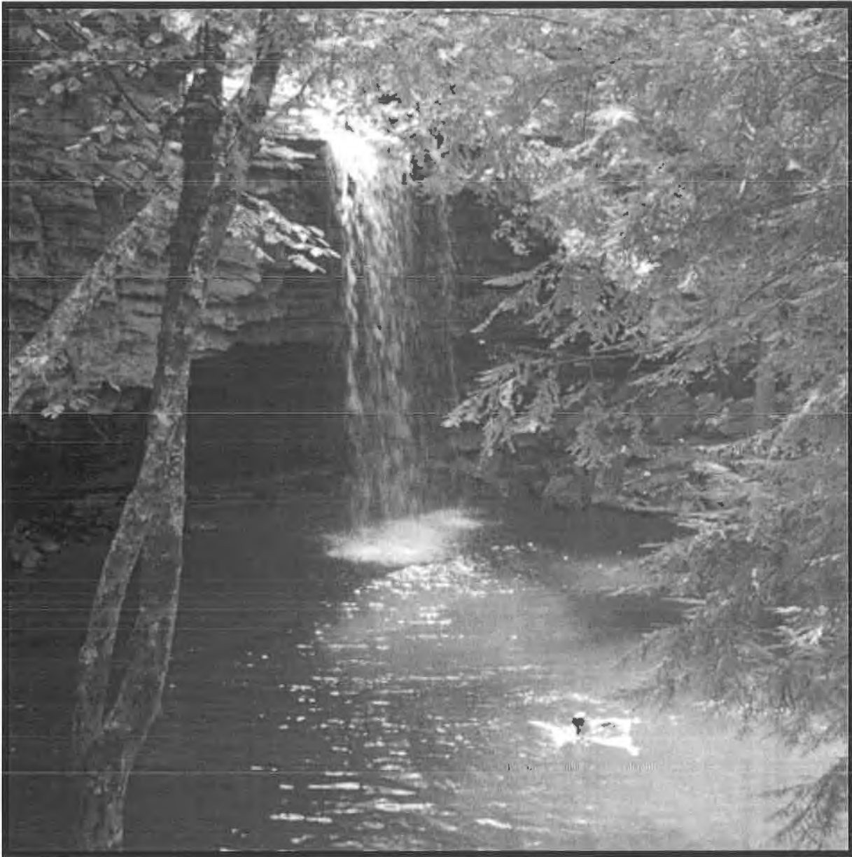
The Jefferson National Forest is the source of the purest streams, rivers, and lakes.