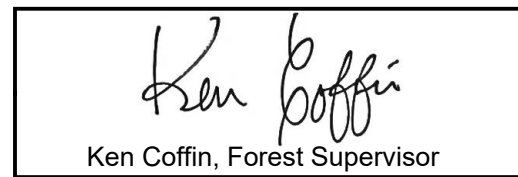
Ken Coffin, Forest Supervisor

The designations shown on this motor vehicle use map (MVUM) were made by the responsible official pursuant to 36 CFR 212.51; are effective as of the date on the front cover of this MVUM; and will remain in effect until superseded by the next year's MVUM.