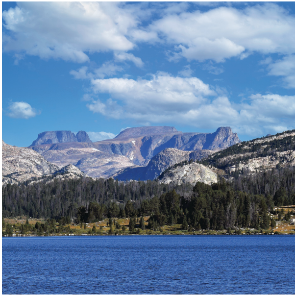
Island Lake, Castle Mountain, and Castle Rock Mountain Island Lake Campground, Mile Post 30