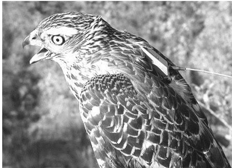
Goshawk with transmitter