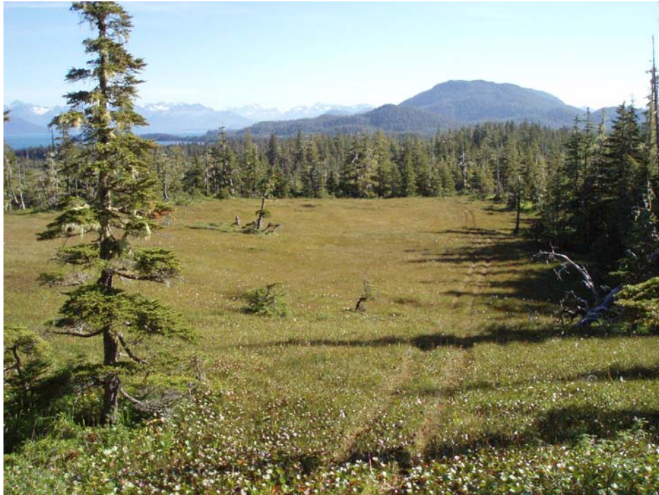
Off-highway vehicle trail on Hawkins Island, summer 2007