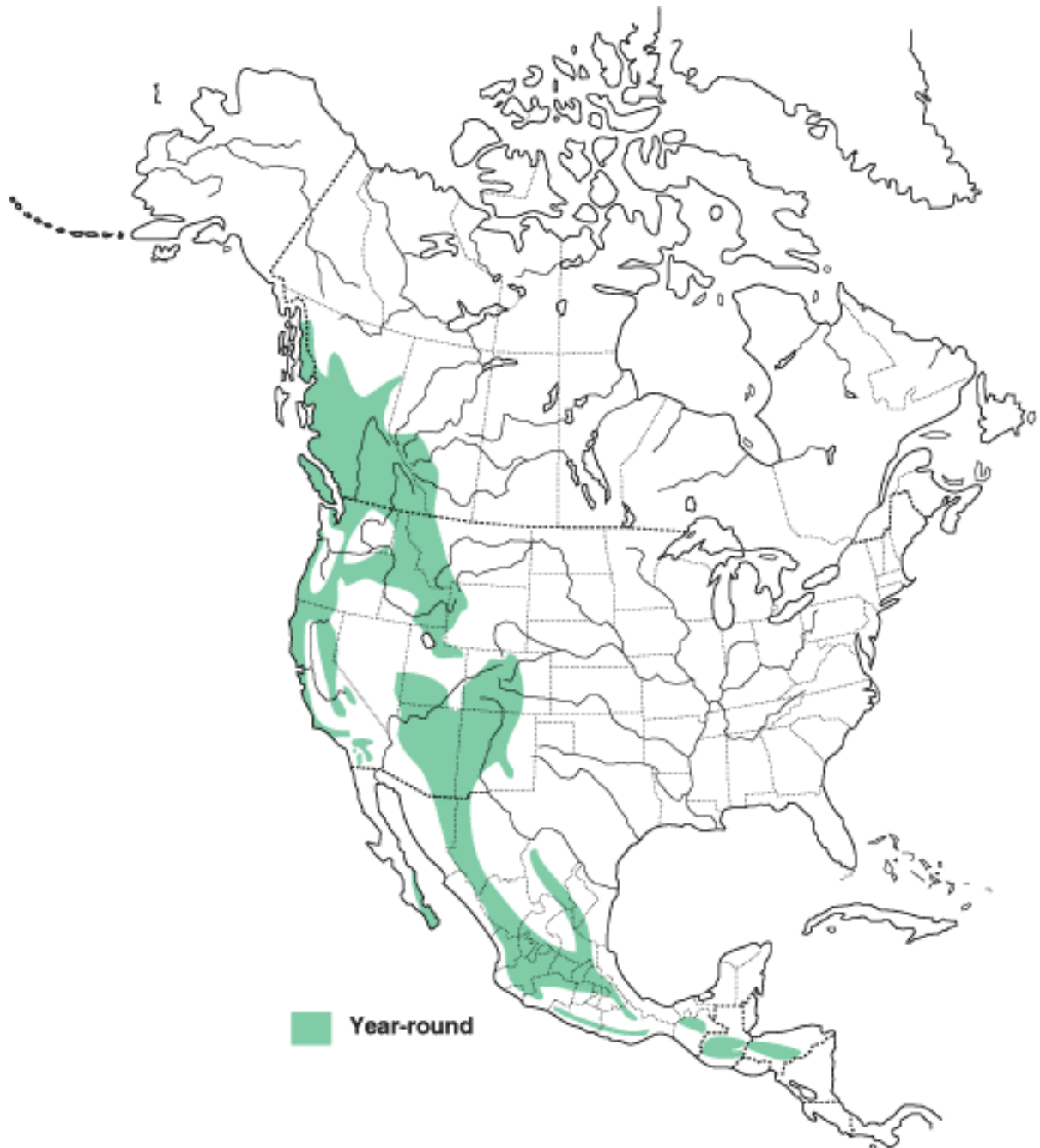
d. Map 1 , Northern Pygmy-owl range map of North America

Wyoming Game and Fish Department. 2017. State Wildlife Action Plan. Northern Pygmy-owl ( Glaucidium gnoma ).