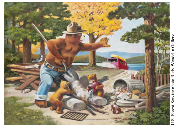
Smokey Bear artwork by Rudy Wendelin titled: Hey Come Back- You Forgot Something .