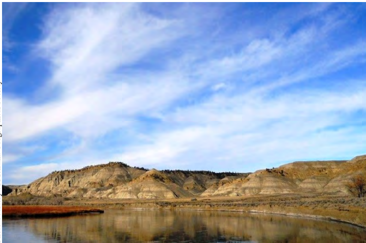
Cow Island Landing skirmish site. The Kipp Homestead is visible in the lower center of the image, while the location of the landing is the immediate left side of the image.

In a war full of momentous decisions and fateful, violent encounters, the skirmish at the landing contributed to the outcome of the war in two noteworthy ways. First, the encounter at Cow Island Landing allowed American military leaders to precisely determine the location, direction, and condition of the Nez Perce caravan. Prior to September 23, the military had lost contact with the Nez Perce caravan and many assumed the bands planned to cross the Missouri far upriver near Fort Claggett.