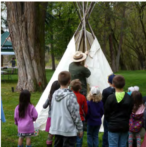
Students observe a tipi raising.

The Park's summer series is in full swing. Demonstrations and speakers are scheduled almost every Saturday June through August in the visitor center. Past events include moccasin and traditional drum making demonstrations. Don't miss out on your chance to attend upcoming events including a beadwork demonstration (8/3, 17), butterfly talk (8/10), and night sky program (8/10). Stop by the visitor center and pick up a free magnet with our summer event schedule.