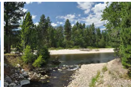
Mouth of Sleeping Child, Cr. Montana