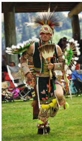
Dancer at Tamkiliks pow wow, OR.