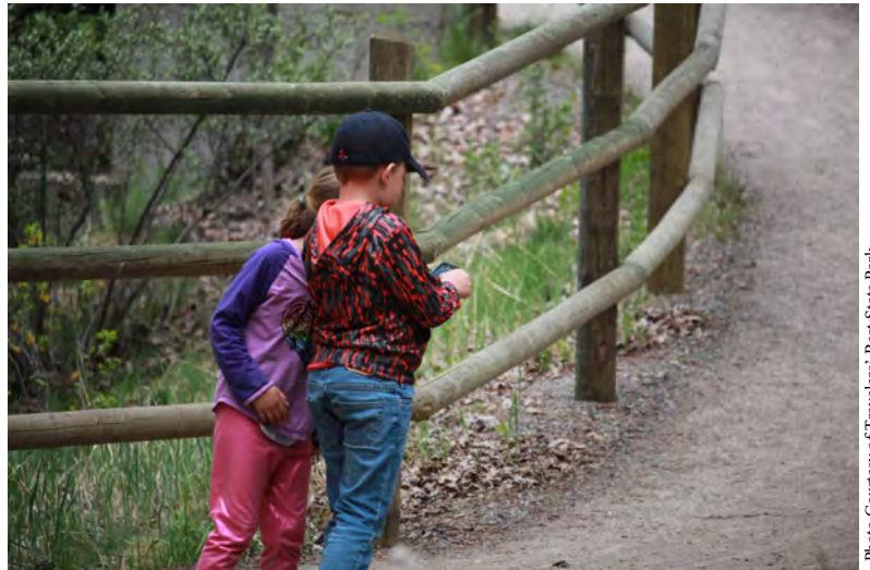
Youth playing the Agent's of Discovery Game at Travelers' Rest State Park, Lolo, MT

Agents of Discovery offers more than 75 missions across the U.S., Canada, and Puerto Rico, guiding young people through forests, parks, preserves, museums, and other public spaces. This platform helps them discover a new way to learn about our natural world.