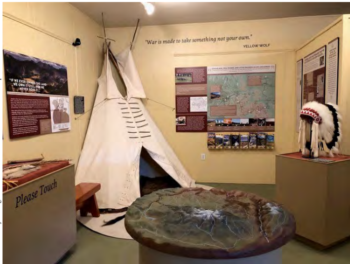
Photo Courtesy of Angela Bombaci Wallowa Band Nez Perce Interpretive Center

It's a dream that has taken years to come true. On Saturday, May 25, the long-planned Wallowa Band Nez Perce Visitor's Interpretive Center became an impressive reality. Its contents were developed and vetted by the Wallowa Band Nez Perce. The Center's new exhibits were fabricated locally. The exhibit is part of the Wallowa Band Nez Perce Homeland Project in Wallowa.