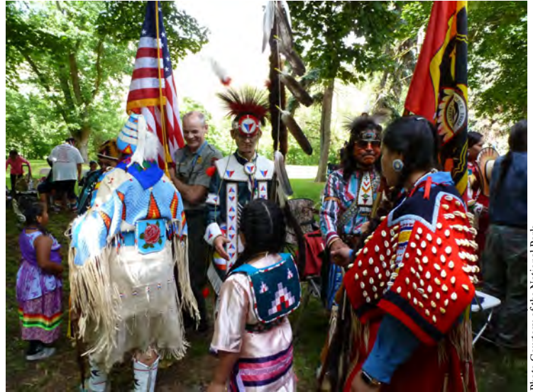
Annual culture day event at the Park, May 2019

In late May, a high wind event blew down numerous large trees on the Heart of the Monster Trail. The trail was damaged and temporarily closed until Park staff, in collaboration with Jonathan Rich Tree Care, Idaho Stage Construction, and Herco Inc. Asphalt, removed the hazardous trees and repaired the trail.