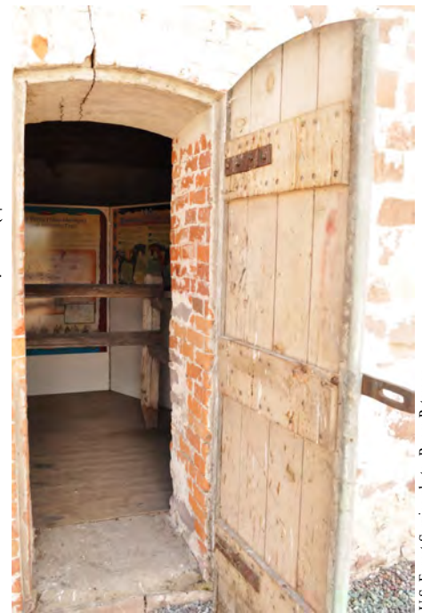
Door opening on new NPNHT exhibit