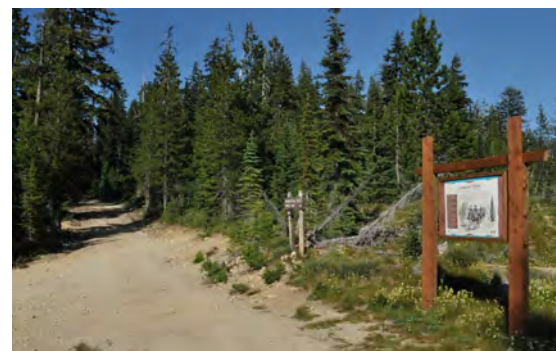
Howard Camp, Lolo Motorway, Idaho.