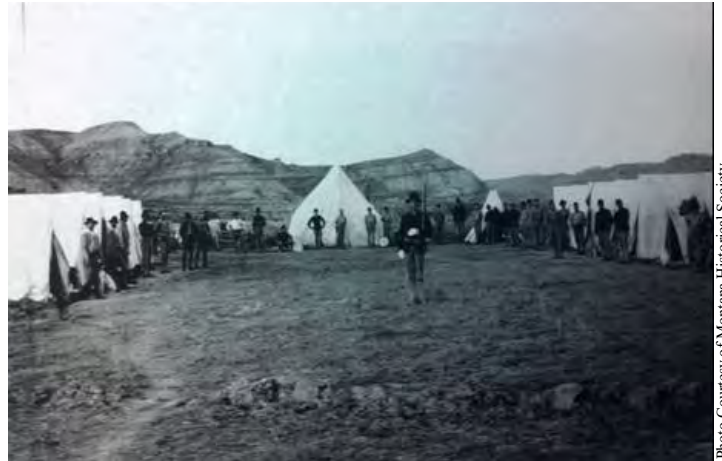
1880 F.J. Haynes image, depicting the U.S. Army and freight camp at the landing. The personnel photographed here were likely clerks, as well as engineers constructing the wing dam at Cow Island built between 1877 and 1880.

With the crossing of the Missouri River at Cow Island, the Nez Perce bands succeeded in placing another formidable river between themselves and the pursuing U.S. Army. As they drew within 85 miles from sanctuary in Canada, the Nez Perce no doubt felt cautiously confident in their ability to cross the border. However, unbeknownst to the bands, Colonel Nelson Miles and his forces had been dispatched from the Tongue River Cantonment, present day Miles City, MT, and were underway to intercept the Nez Perce.