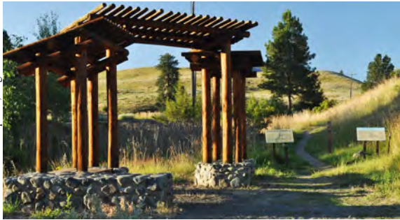
Iwetemlaykin State Heritage Site near Joseph, OR.

It has been an extremely busy summer for the staff of the Nez Perce (Nee-Me-Poo) National Historic Trail (NPNHT). The staff shared our NPNHT Traveling Exhibits with visitors at the Upper Missouri River Breaks Interpretive Center in Fort Benton in May and June, and with attendees of the Central Montana Fair in Lewistown, MT, in late July. If you know someone who would like to borrow these traveling exhibits please let us know.