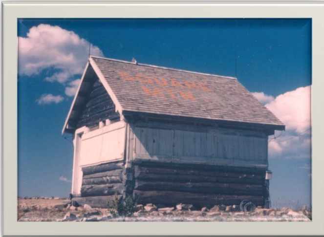
Square Mountain Lookout, 1960. An L-5 style, this log lookout is a ground cab with a gable roof. Built in 1931, the lookout has been restored and is used on an emergency basis. Square Mountain Lookout is located on the Salmon River Ranger District.

The L-5 is a 10' x 10' frame pre-cut lookout house (smaller version of the L-4) built mostly at secondary lookout points in the 1930's. The term "L-5" was also given to a handful of 14' x 14' gable-roofed log cabins in Idaho and Montana.