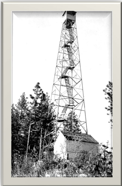
Quartz Ridge Lookout, 1953. This 100' steel Aermotor tower was built in 1934. It was located twelve miles SE of Grangeville on the Clearwater Ranger District. It was removed sometime after 1969.

Aermotor refers to the Aermotor Company of Chicago, Illinois, famous for their windmill towers. The lookout towers of this type are more frequently found in the southeastern United States and are somewhat rare in the Pacific Northwest.