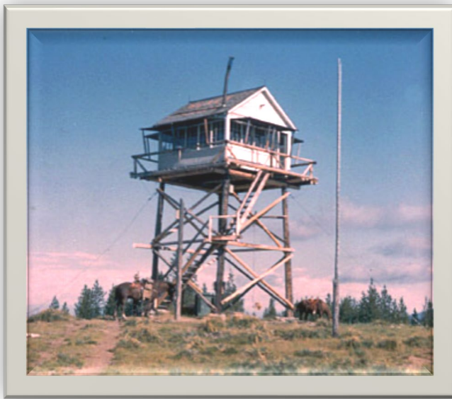
Blackhawk Lookout, 1950s. This pole L-4 tower was 20' tall with a gable roof. Built in the 1930s, Blackhawk Lookout was located eight miles east of Elk City on the Red River Ranger District. It was removed in the 1950s.

The L-4, also known as an "Aladdin", is a standard 14 x 14 foot frame pre-cut lookout house built from 1929 through 1953. It has a peaked roof and wooden panels that are mounted horizontally over the windows. The panels provide shade in the summer and are lowered over the windows in winter. Early models have a gable roof; later models have a hip roof.