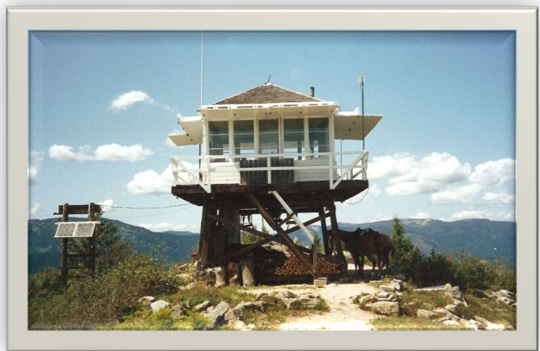
Shissler Lookout, 1992. This treated timber L-4 tower is 10' tall with a hip roof. Built in 1953, Shissler Lookout remains staffed and is located three miles north of Moose Creek Ranger Station on the Moose Creek Ranger District within the Selway-Bitterroot Wilderness.