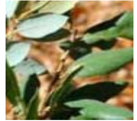
Canyon Live Oak