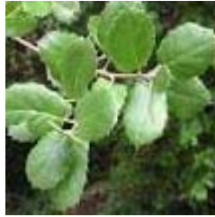
Coast Live Oak

Match the leaf to the picture on the right and circle the species name of the oak tree.