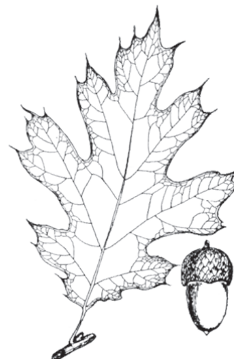
Fig. 178. Quercus kelloggii Newb. Leaf, fruit, \times \frac{3}{4} .