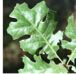
California Black Oak