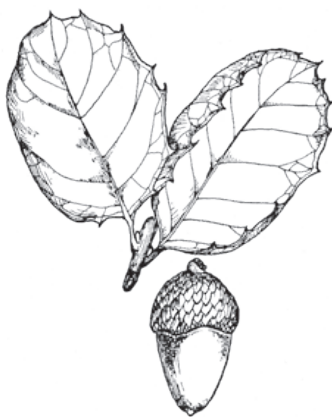
Fig. 166. Quercus agrifolia Née. Leaves, fruit, \times \frac{3}{4} .