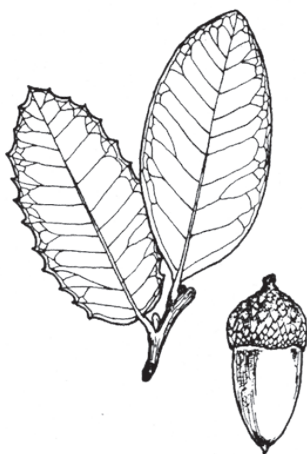
Fig. 172. Quercus chrysolepis Liebm. Leaves, fruit, \times \frac{3}{4} .

The oak borer attacks coast live oaks, canyon live oaks, and black oaks. Canyon and coast live oaks are common in California along streams and in meadows. They are called “live oaks” because they remain green and “live” throughout winter, when other oaks lose their leaves and are “dead”-looking. Black oaks grow in forests, and their leaves turn yellow and drop in the autumn.