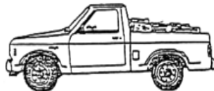
Short Bed Pickup -- 1/2 to 3/4 ton = 1 Tag