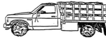
Flat Bed Truck 10' Bed 2' Racks= 3 Tags 4' Racks= 5 Tags 5' Racks= 6 Tags