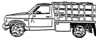
Flat Bed Truck 8' Bed 2' Racks= 2 Tags 4' Racks= 4 Tags 5' Racks= 5 Tags