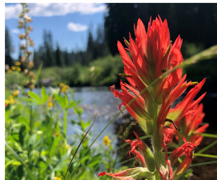
Top: The Sky Lakes Wilderness Area has numerous high-elevation lakes that offer solitude and adventure.