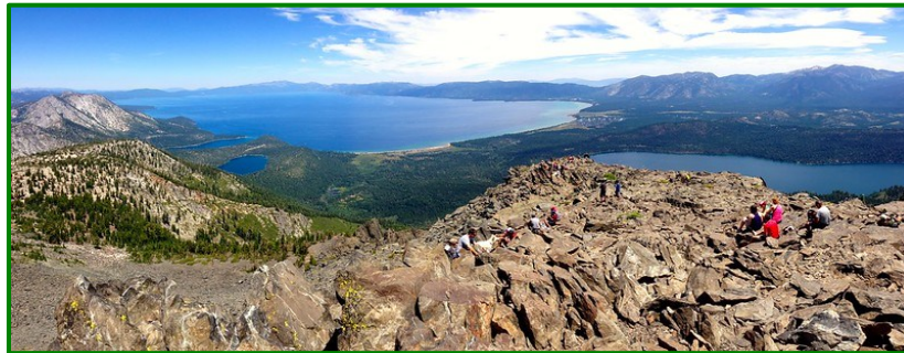
"Lake Tahoe from Mt. Tallac"

Microsoft Teams: https://teams.microsoft.com/meet/21142543588862?p=0yMB1vhO36WXzSnlvF