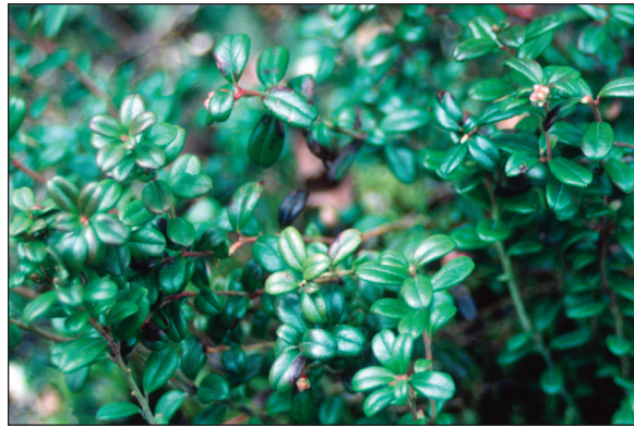
Figure 2. Kinnikinnik ( Arctostaphylos uva-ursi ), the alternative host of spruce broom rust. Notice spots on leaves caused by the rust fungus.

Once spruce trees are infected, the perennial witches'-brooms develop over a period of several years. The fungus remains alive in the infected bud and twig tissues of spruce for many years. It probably alters the growth hormones at the point of infection; resulting in increased growth and production of numerous short, lateral shoots. Over several years this abnormal growth develops into a witches'-broom.