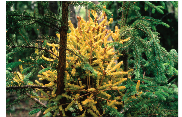
Figure 1. Live broom in spring with short, yellowish needles.

To complete its life cycle, most rust fungi must infect two different types of plants. Spruce broom rust infects kinnikinnik (Figure 2), sometimes called bearberry ( Arctostaphylos uva-ursi (L.) Spreng). This low-growing, trailing plant has flexible stems, round and leathery perennial leaves, and red berries.