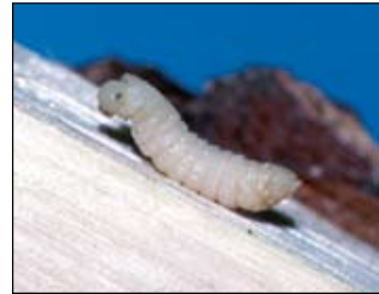
Figure 4. Wood borer larvae: A. Roundheaded borer ( Cerambycidae ); B. Flatheaded borer ( Buprestidae ).