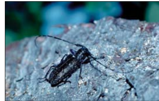
Figure 1. Adult long-horned beetle, Monochamus scutellatus .

Wood boring insects are commonly associated with diseased, stressed, or dying spruce trees in Alaska. Commonly encountered woodborers are members of two insect orders; the Coleoptera, or the beetles, and the Hymenoptera, or the wasps. The wood boring beetles are members of two families; the long-horned beetles (also called roundheaded woodborers) (Cerambycidae) and the metallic woodborers (flatheaded woodborers) (Buprestidae). Adult long-horned beetles are characterized by antennae that are at least as long as their body (Figure 1). Their larvae have a rounded head, and they make galleries in the sapwood that are rounded when viewed in cross section. Metallic woodborers are wedge-shaped beetles and are often shiny in appearance (Figure 2). Their larvae have a flattened head, and they make oval-shaped galleries in the sapwood when viewed in cross section. Wood wasps are large, menacing looking yellow and black wasps about 2.5 cm long (cover photo). Their larvae are stout, legless grubs, about 1.5 cm long, with a darkened horny protuberance on the rear end (Figure 3). All three woodborers have similar life histories.