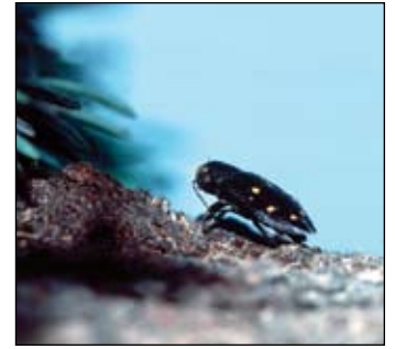
Figure 2. Adult metallic woodborer, Melanophila sp.

Generally, woodborer larvae are elongate and whitish; they have a legged or legless body, depending on the species, and dark brown mandibles (Figure 4). Full-grown woodborer larvae measure about 5 cm in length.