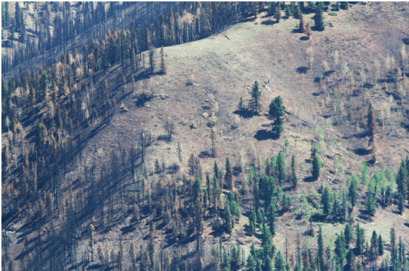
The 416 Fire scar is the focus of a citizen science effort to map noxious weeds that spring up post-disturbance.