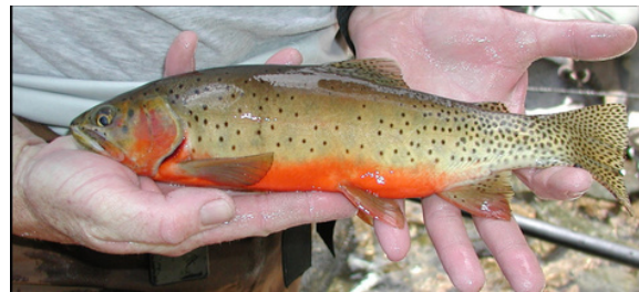
Populations of the San Juan Lineage Colorado River Cutthroat Trout will grow and become more resilient thanks to multiple fish barrier projects.

incredibly rare fish. By stocking the San Juan Lineage Trout in additional streams, the species grows more resilient to disturbance. Partners on these projects include Colorado Parks and Wildlife , Mountain Studies Institute , National Forest Foundation , Southwest Conservation Corps , and Trout Unlimited . This work is just one example of the way a landscape-scale program can have greater impacts.