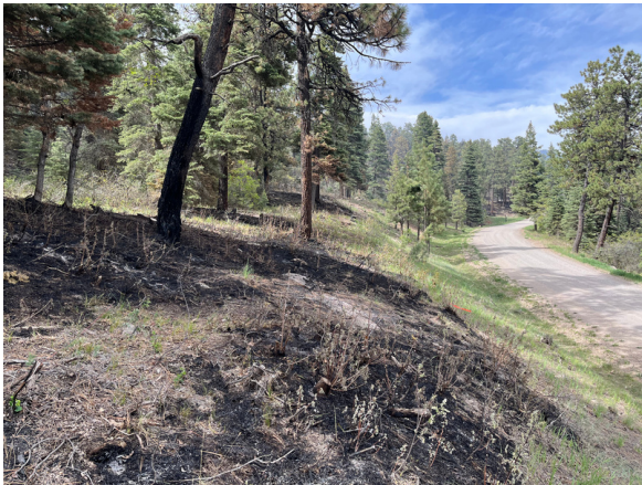
Firefighters on the Plumtaw Fire used a fuels reduction treatment along Fourmile Road to stop the fire's spread.

Partners from around Colorado have come to the table to develop the CFLRP governance structure which, when completed, will lead and coordinate collaborative input on CFLRP efforts for Forest Service and associated projects on adjacent lands.