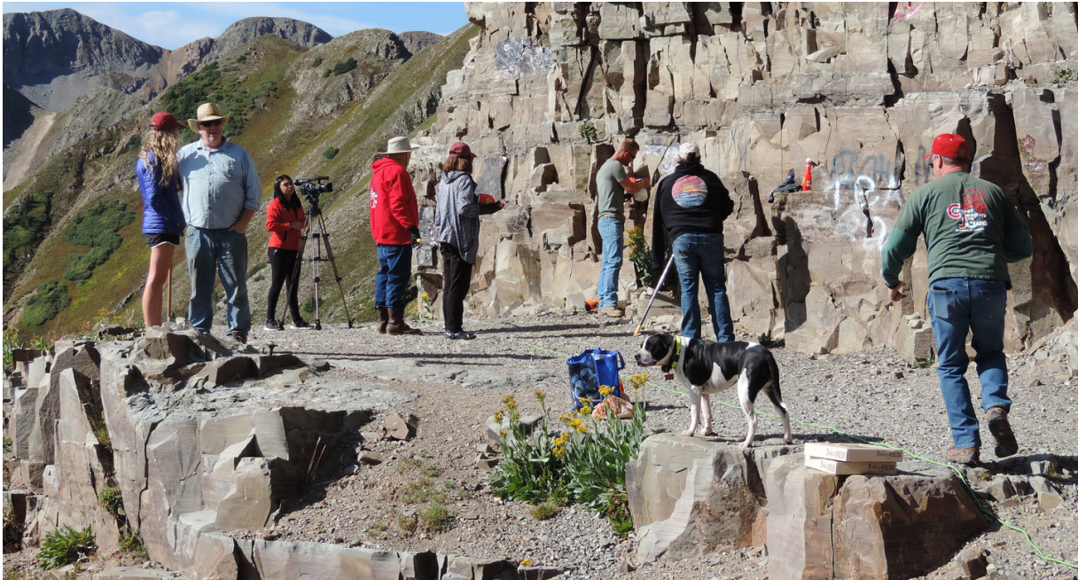
In 2021, Creeper Jeepers Gang Jeep Club, Colorado Jeep Girls, La Plata County, and Keeping Colorado Beautiful tackled an ambitious graffiti removal project at Kennebec Notch.