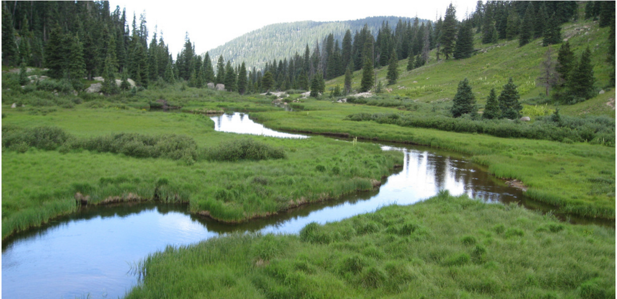
Florida River in summer