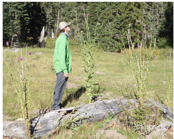
Plumeless Thistle is one of the multiple noxious weeds the San Juan NF is concerned about.

Identifying and eradicating invasive weeds also has a substantial impact on our regional ecosystem. While this project focuses on the 416 burn scar, its collaborative framework and results have far-reaching implications for Colorado forests and beyond.