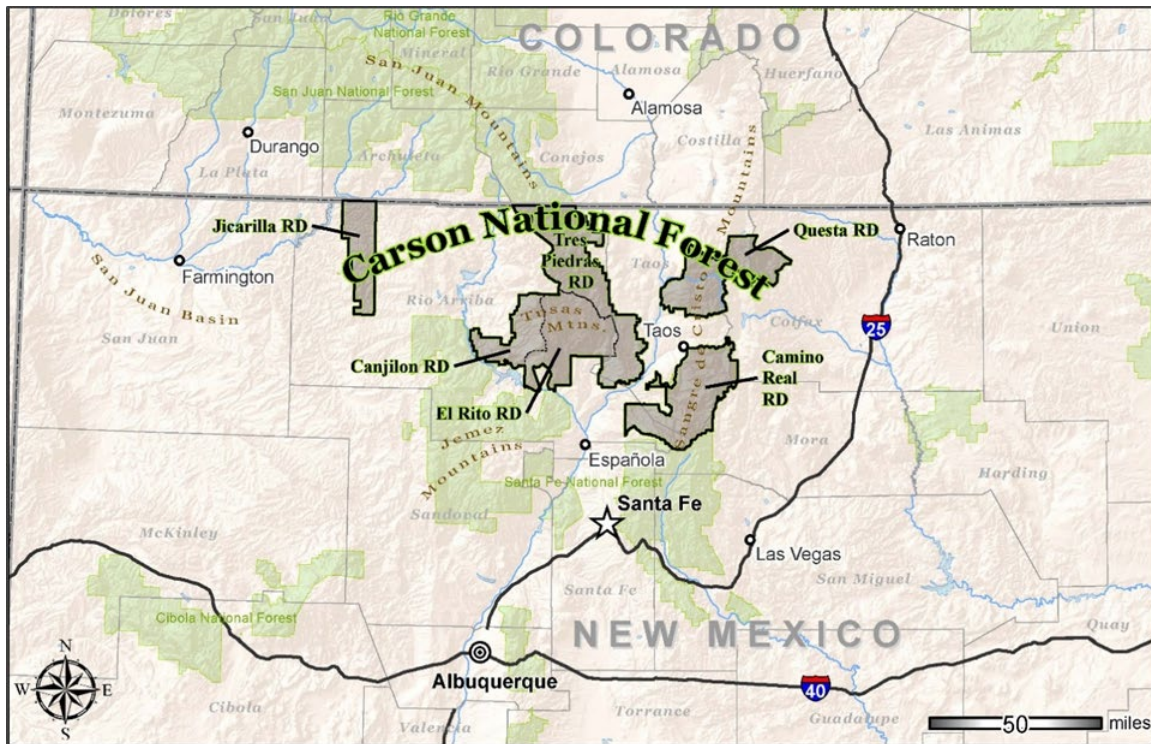
Figure 1. Vicinity map of the Carson National Forest

Fe National Forest; Taos Pueblo; Jicarilla Apache Nation; Southern Ute Tribe; Picuris Pueblo; U.S. Department of Interior; Bureau of Land Management (BLM); the towns of Red River, Questa, Taos, Taos Ski Valley, Peñasco, Tres Piedras, El Rito, Canjilon; and private lands. The final LMP covers all NFS lands within the Carson National Forest boundary.