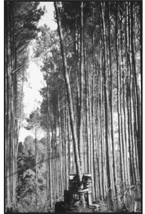
Converting a high density pine plantation to a silvopasture system starts with thinning the trees.

The technique discussed in this technical note is meant to provide a starting point for individuals who are considering establishing silvopasture systems in their loblolly pine plantations. Similar results could be expected when converting a well-stocked naturally regenerated pine stand. The timber yield and forage response will vary based on localized site conditions and species. Adjustments in management must be based on observations and desired production levels.