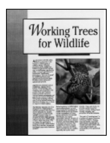
The new Working Trees for Wildlife brochure is now available from the Center.

Visit our web site for a preview of any of these materials: www.unl.edu/nac. You can now access our publication list online and order any of our publication electronically. We've added a lot of new information to our site. Take a look and tell us what you think.