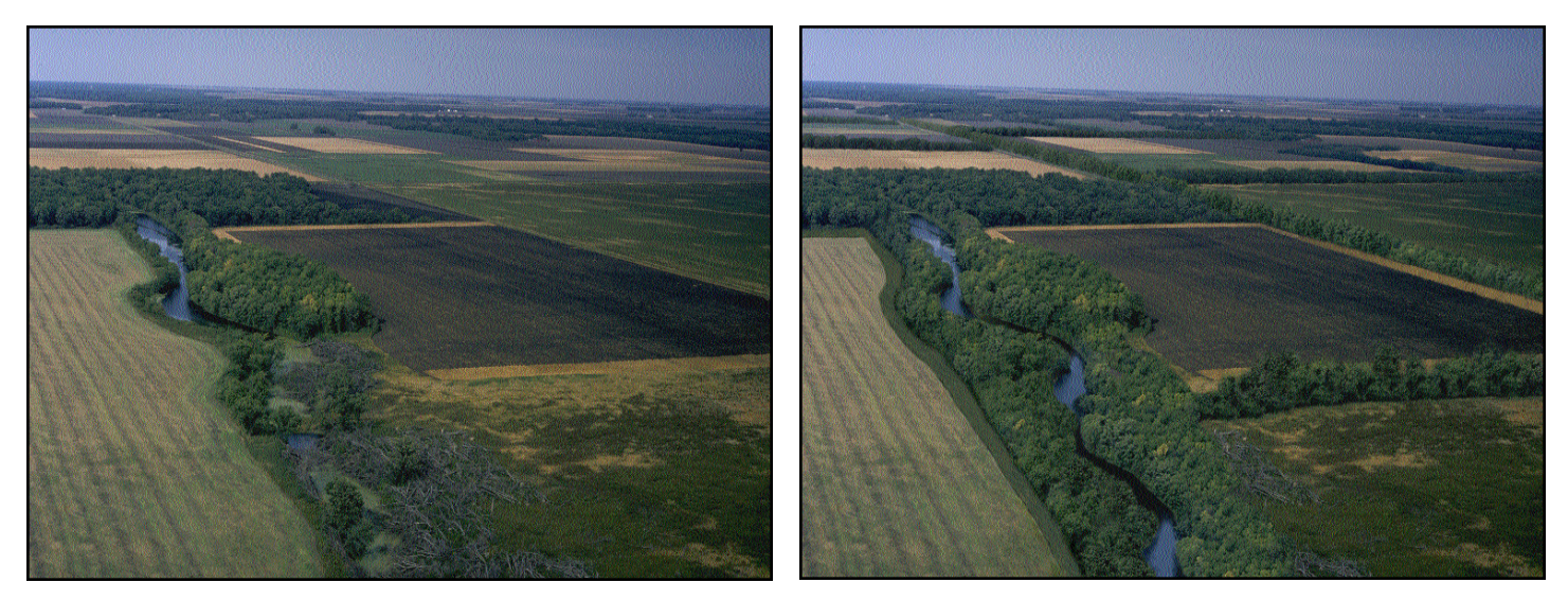
Agroforestry practices can provide wildlife habitat as well as help address many environmental concerns, making a landscape more healthy. On the left is a landscape that could be enhanced with agroforestry practices. On the right the same photo has been digitally enhanced by adding trees and shrubs. Note the connected field windbreaks which provide travel lanes for wildlife as well as protect soils, crops, and livestock. The riparian zones provide benefits for terrestrial and aquatic wildlife, while helping to improve water quality.