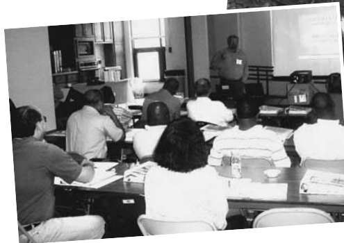
Workshop participants received both classroom instruction and hands-on field examples.

This year, 27 individuals participated, including faculty from twelve of the eighteen 1890 universities and staff from the Alabama Farmers Federation, the Alabama