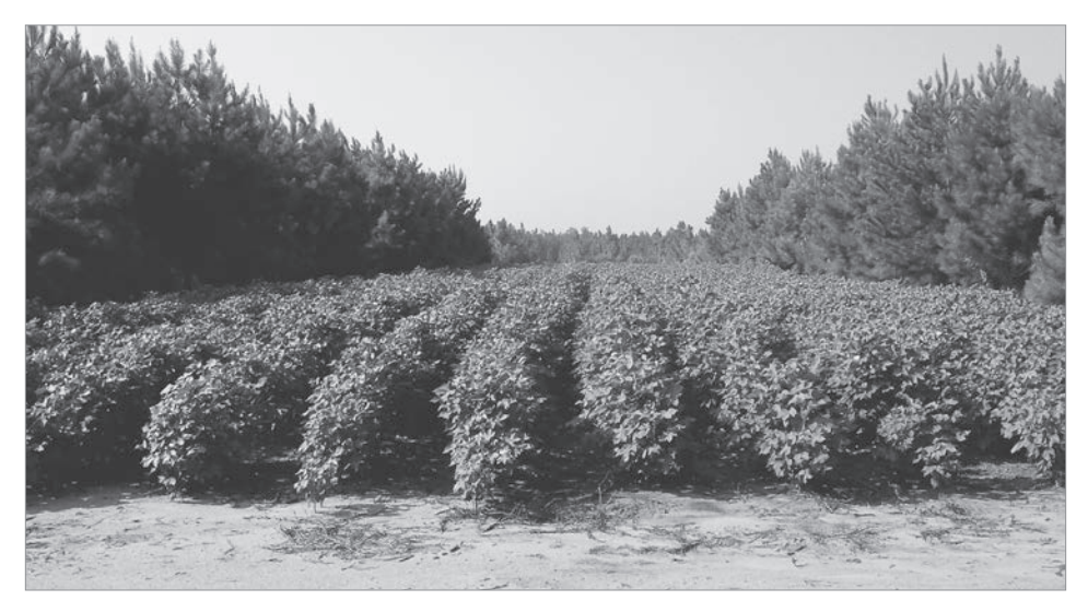
Alley cropping system with cotton and pine trees.

It was also at this time that the Center for Agroforestry at the University of Missouri and Hammon's Products Company of Stockton, Missouri entered into a cooperative research/demonstration effort to evaluate the benefits (economic, environmental, biological and social) of alley cropping with black walnut. The initial plantings created 40-foot alleyways within which conventional agronomic crops such as corn, soybean and milo were double-cropped with wheat. While the alleyways proved too narrow to maximize the production opportunities, much was learned that has served as the basis for improving alley cropping designs to better meet the needs of temperate zone landowners.