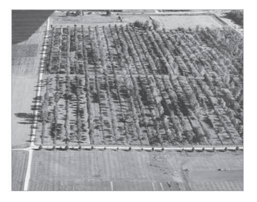
Alley cropping research plots at Guelph.