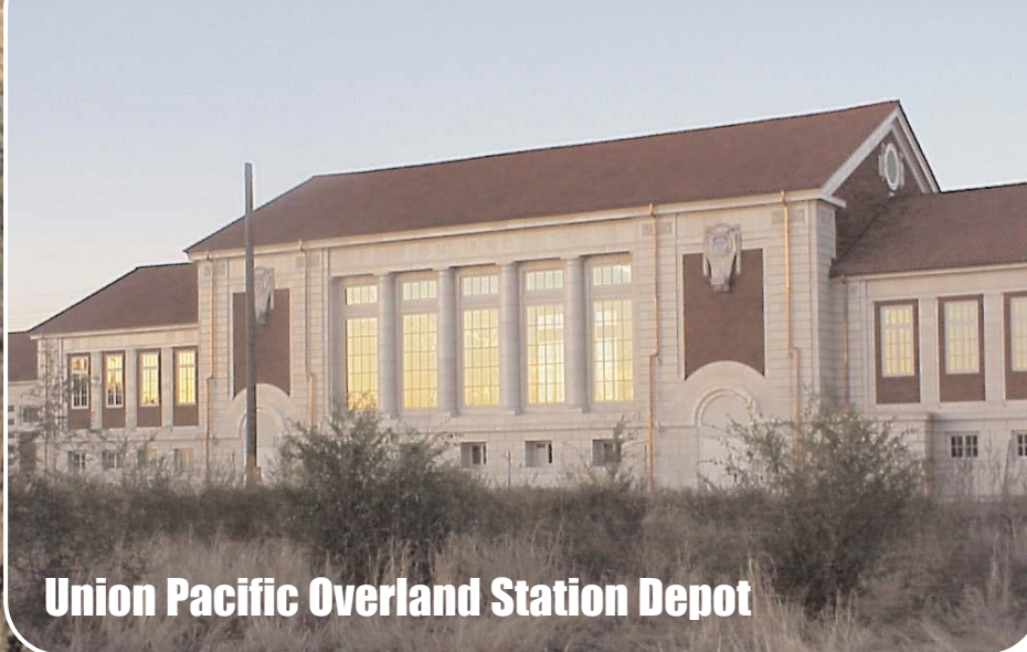
Union Pacific Overland Station Depot