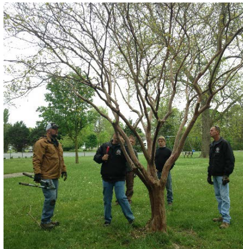
Workshop participants practice pruning techniques in a local park.