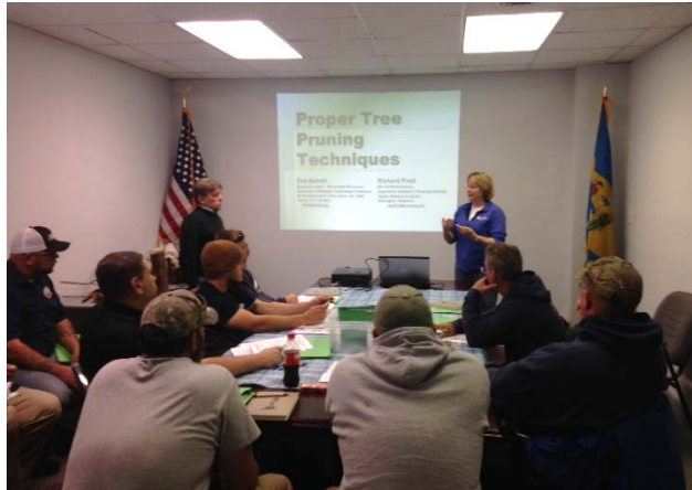
Participants of a municipal pruning workshop learn about proper tree pruning techniques.