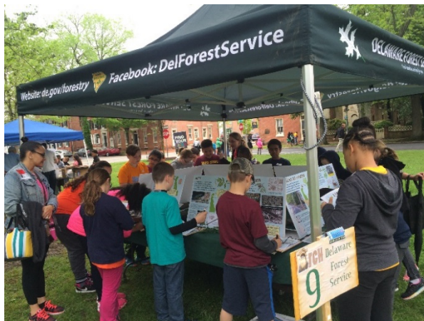
Fourth grade students participate in the Arts, Culture, and Heritage Preservation Field Days.