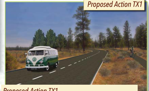
Proposed Action TX1