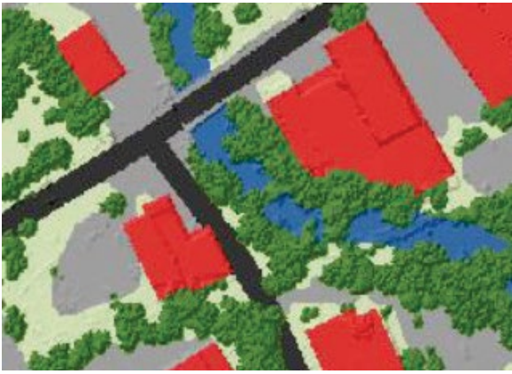
Example of high-resolution land cover map.