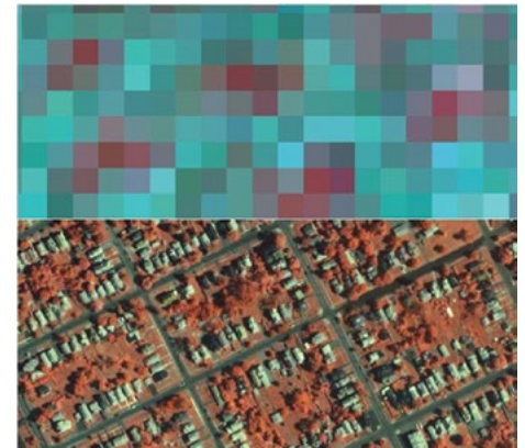
High resolution (below) vs. 30-m imagery.