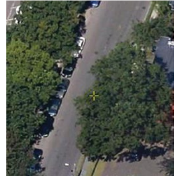
Photo-interpretation involves classifying randomly located points within preselected cover classes (e.g., tree, impervious, water).