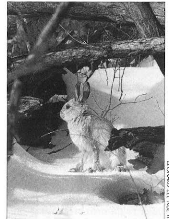
LOWERY LEE RUE III

Our life is good here in this beautiful wooded country—but it is changing.—Dwight Lewis