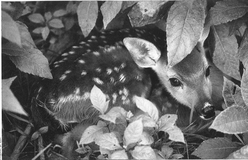
WILLIAM S. LER

Who can resist the sight of a spotted fawn in sun-dappled woods? But Bambi and his brethren in some areas are driving out such fellow forest dwellers as snowshoe rabbits, wild ginseng, and the valuable black cherry.