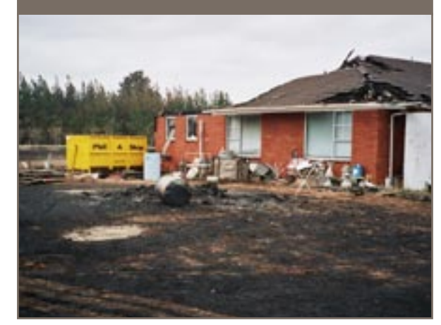
FIGURE 2. The fire resulted in significant damage—grasslands, wood lots, orchards, a vineyard, outbuildings, hedges and fences, farm equipment and a house were destroyed over an area of 130 ha.

Regarding impacts of the wildfire, old lifestylers described the impacts as being more significant for new lifestylers than themselves. Old lifestylers argued that they were not as adversely affected because, having more experience living in an area of high fire risk, they had taken steps to increase their preparedness. Because new lifestylers had come to West Melton more recently and were primarily from urban areas, they lacked the experience and therefore local knowledge necessary to live safely in a rural area. As an old lifestyler observed about new lifestylers, "Most people are not aware of or prepared for fire. Most come from the city and do not know farming practices or fire risk." Many new lifestylers agreed with that assessment. When asked if they were prepared for wildfire, one new lifestyler indicated that they were prepared for some civil defence emergencies but not for wildfire. Old lifestylers argued that a wildfire is a major risk for a rural area, and therefore having correct rural knowledge about how to prepare for wildfire is critical.