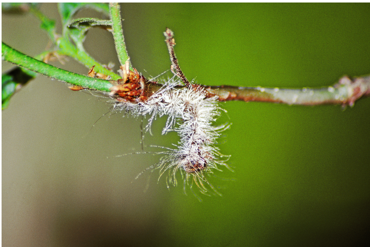
PLATE 1. Fourth-instar gypsy moth larva killed by Entomophaga maimaiga . E. maimaiga conidia have already been ejected from the cadaver, and some conidia landed on dark larval setae, which now appear white due to a coating of conidia. Larval prolegs are gripping a red oak twig, while the anterior portion of the body is bent downward.

larvae that died in which both pathogens were able to reproduce is consistent with the finding of Malakar et al. (1999b) of the temporal precedence of infection.