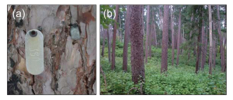
Fig. 1. ( a ) Example of a recent and an original tree tag found on a Pinus resinosa individual in the Allison plot. ( b ) Example of typical stand structure within the Allison plot in 2010.

locations for each tree without a 2012 location, based on this distribution of mapping discrepancies.