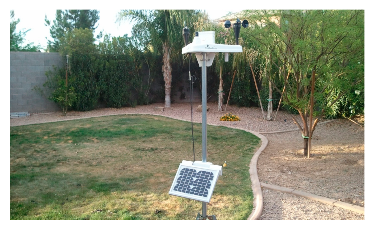
Figure 3. Micrometeorological towers used to monitor variables related to people's perceptions of their immediate climate. Towers include sensors that measure air temperature, relative humidity, wind speed, and light at 2 m height, as well as soil temperature, soil moisture, and irrigation water use.

Figure 2. Street view of the property in Goodyear, AZ, USA where the experimental demonstration streetscape will be constructed. The park was to be on the left and the historical neighborhood is on the extreme right.