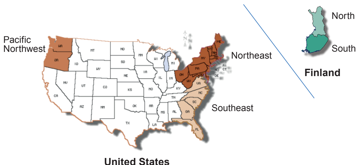
Figure 1. The location of the study regions in the United States and Finland.

been in private ownership since the middle ages. Forests in southern Finland were severely over harvested in the 19th to early 20th century. In northern Finland, the lands are largely state owned. Industrial forest harvests were common in southern Finland through the 20th century, while they rarely occurred in northern Finland before the 1950s.