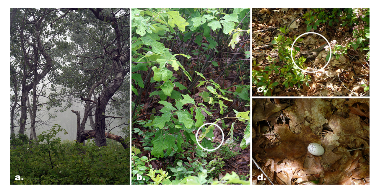
Figure 3. (a) A typical eastern whip-poor-will nest site in scrub oak in western Massachusetts, USA (nest present but not visible). Note the presence of deciduous canopy cover and dense understory vegetation. (b) The same nest site as shown in "a" with eggs partially visible (in circle). (c) A typical eastern whip-poor-will nest site and brooding adult (in circle) in treated pitch pine, with less understory vegetation. (d) The same nest as shown in "c" with an egg and a camouflaged nestling.

after hatching, but we do not know what happened to the second nestling. Overall, we were unable to determine whether nestlings that disappeared were depredated or if we just could not locate them after they moved.