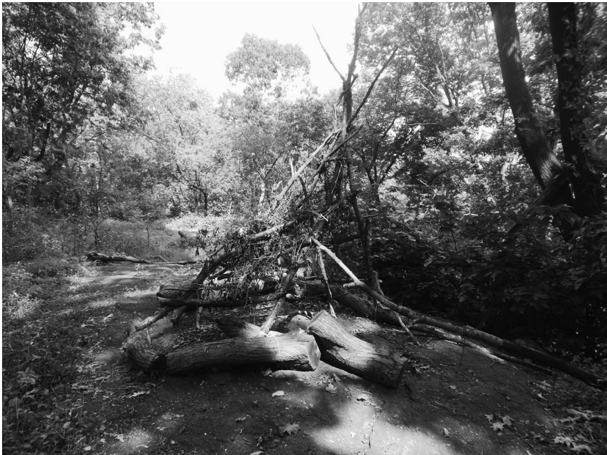
Figure 7. Teepee structure at Inwood Park.