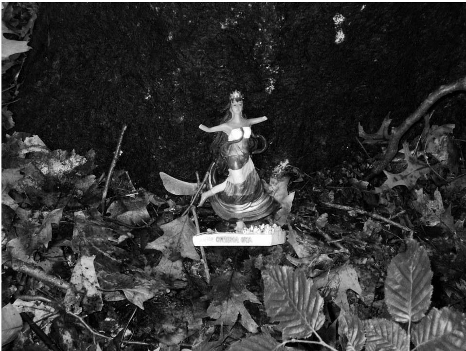
Figure 9. Orisha Oyá figurine at Alley Pond Park.