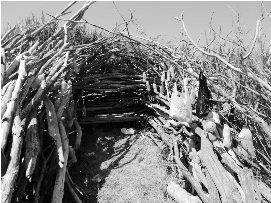
Figure 6. Assemblage of branches and bottles at Conference House Park.