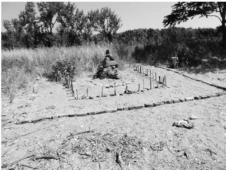
Figure 5. Rock cairn at Conference House Park.