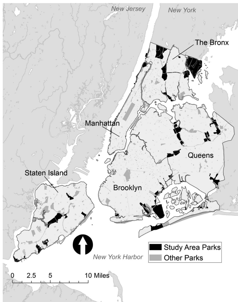
Figure 1. Map of New York City and Locations of Study Parks.

photographing signs of past human use, and field notes. Observed human activities were grouped by function (e.g., sitting, socializing, bicycling, exercise, and nature recreation). Adult interviewees were asked about park use and engagement. We did not conduct interviews with people under 18 years of age because seeking permission from a parent/guardian would have complicated and extended the process. In accordance with administrative policies, interviews were not conducted in National Park Service (NPS)-managed land (i.e., Canarsie Pier, Floyd Bennett Field, Fort Tilden Park, Frank Charles Memorial Park, Hamilton Beach, and Jamaica Bay Wildlife Refuge). Because the interviews were rapid and did not allow time to establish rapport, individuals were not asked about their cultural identities, gender, or age, which can be sensitive and discourage participation. Instead gender and age categories were observed and recorded. Interviewees ( n = 1680 ) were: 56.8% male, 41.9% female, and 1.3%