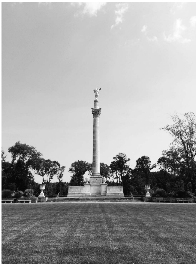
Figure 3. World War I Memorial at Pelham Bay.

Park users also observed the way urban nature resembled more rural spaces. At Inwood Hill Park in Manhattan, a respondent said, “[It’s] quiet, wooded, feels like you’re out of the city.” Although natural areas may have been created as nature preserves, it is clear that they also provide refuge for people.