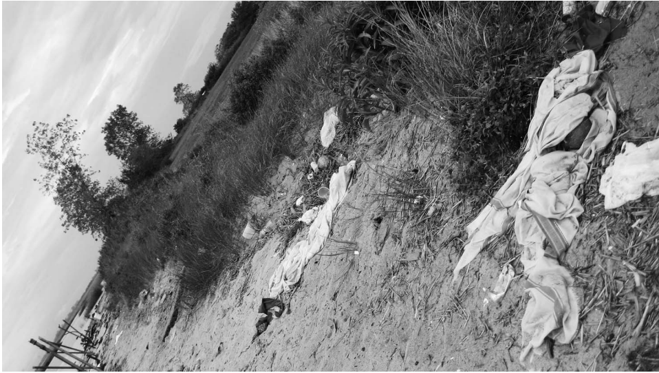
Figure 8. Sari and other Hindu ritual debris at shoreline, Broad Channel American.