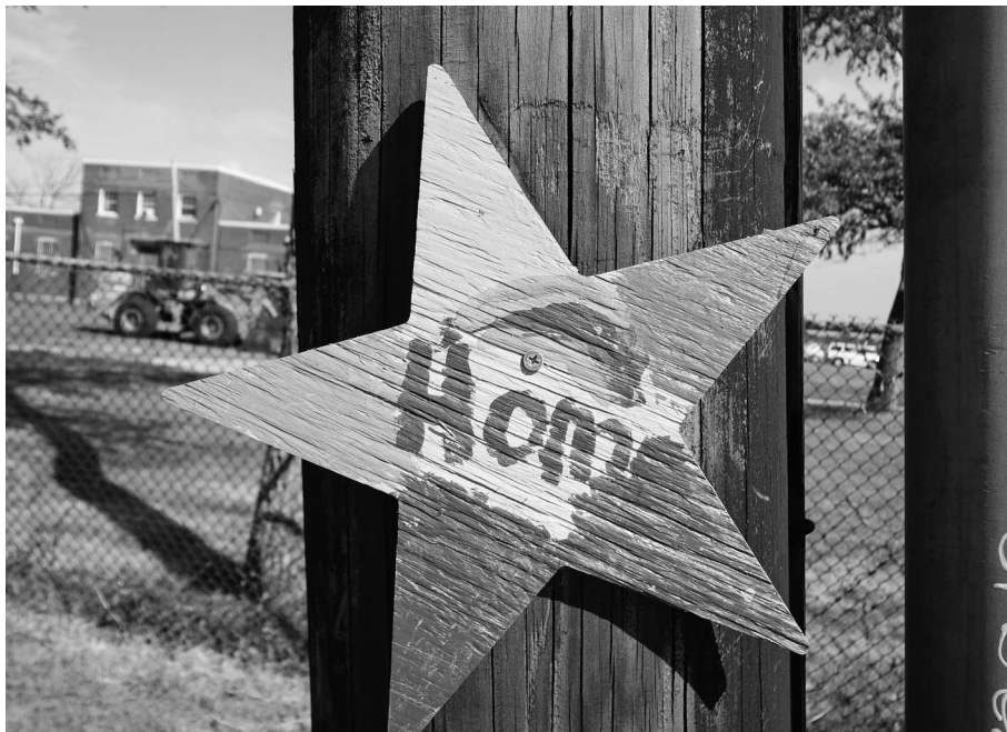
Figure 4. "Stars of Hope" Memorial to Recovery of Hurricane Sandy, edge of Fort Tilden Park.