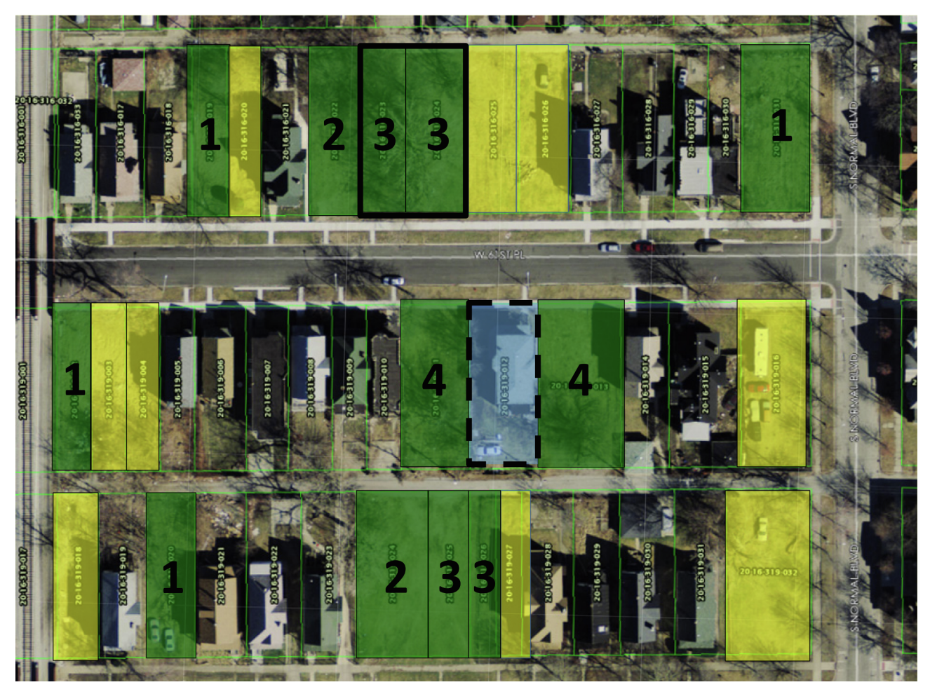
Fig. 3. Demonstration of proximity coding showing a hypothetical owner's property (center, blue with dashed border), proximity values (ordinal scale with 1 = low or farthest, 4 = high or closest) for available large lots (green), and other vacant lots on the block (yellow). Solid border around the two large lots at the top of the photo shows coding if two lots are purchased directly side adjacent to one another (see text). (For interpretation of the references to colour in this figure legend, the reader is referred to the web version of this article.)