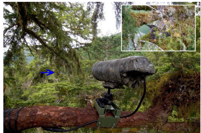
Fig. 1. Photo showing placement of a zoom lens relative to the Hemmingsen Creek Marbled Murrelet nest in 2006 (nest is indicated with arrow), on Vancouver Island, British Columbia. Zoom lenses were typically placed in nearby trees on limbs 30–50 m from the nest. A ~ 50 m cable extended from the lens to the ground. Deep-cycle batteries (for powering the camera) and a digital video recorder (for recording and storing video files) were placed on the ground below the camera tree. Thus, when we visited the nest to replace batteries we did not have to climb the camera tree. Inset photo in upper right shows the Hemmingsen Creek Marbled Murrelet incubating an egg on the nest.

We visited all nests after the nesting season to view nest contents. For nests that were not video monitored, we considered nests