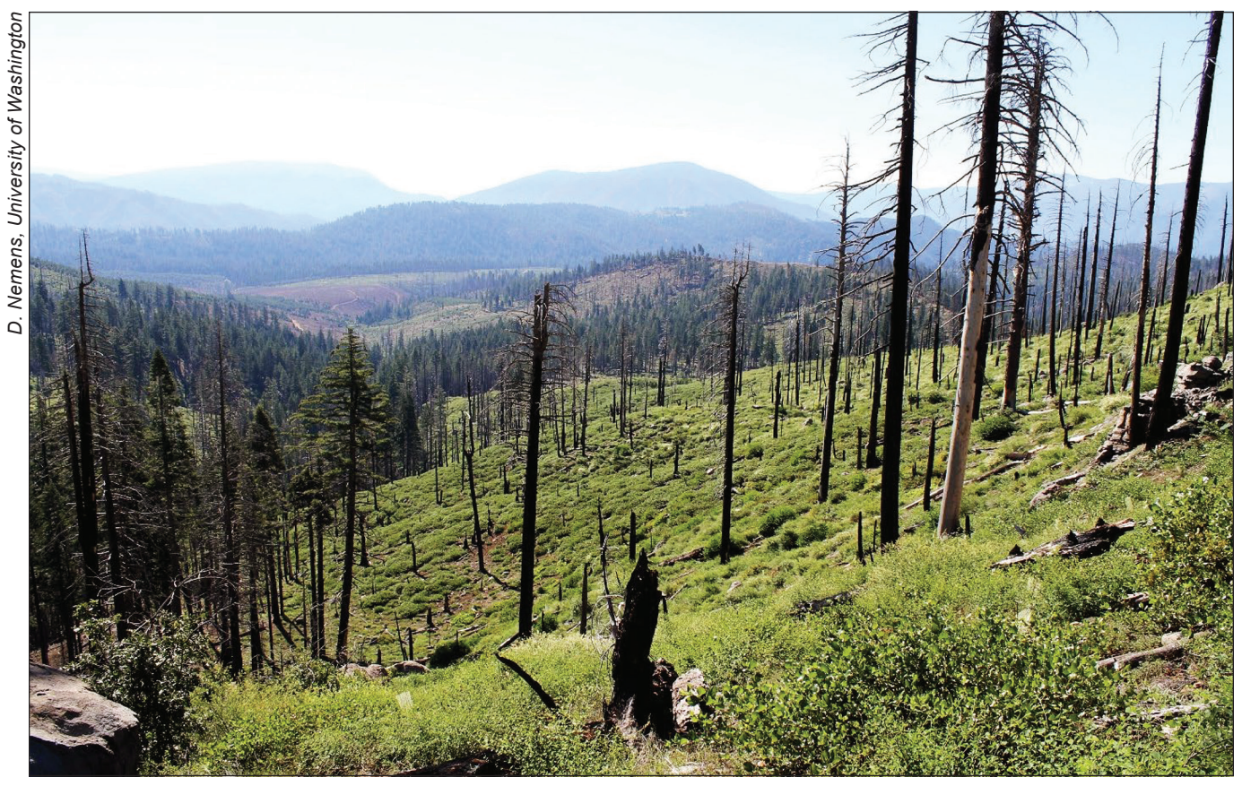
Figure 3—Fifteen years after the Storrie Fire, and 3 years after the Chips Fire, Lassen National Forest, California. The foreground shows an area where no action was taken, while postfire logging (on private timber holdings) is visible in the distance.